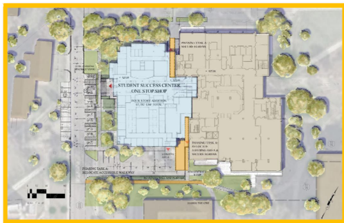
Figure 1 - GMU SUB I Site

Building I. This process will be in accordance with the Commonwealth of Virginia design-build procedures. The building will cost approximately $17.5 million. The project started in June of 2009 and is slated to finish in July of 2010 (estimated). The architects on the project