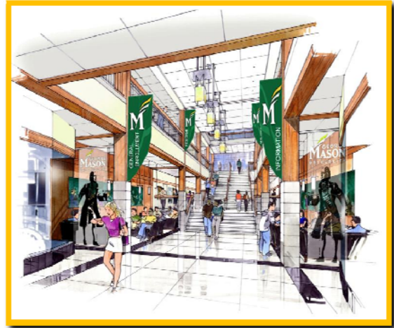
Figure 2 - Interior Rendering

George Mason University has had rapid growth at all of the campuses over the last couple of decades. George Mason's student population has increased to over 18,000 undergraduates. This growth has led to an increased demand for on-campus Student Union support and office space as George Mason University develops its educational operation. To satisfy this order of expansion, GMU has facilitated a 65,382 Gross Square Foot, four story addition to the existing Student Union Building I, located off of Aquia Creek Lane, soon to be renamed George Mason Boulevard. The addition will house meeting spaces, offices, and student service and activity spaces. With this in mind, George Mason University has decided to implement a design-build process to construct the addition to the existing Student Union